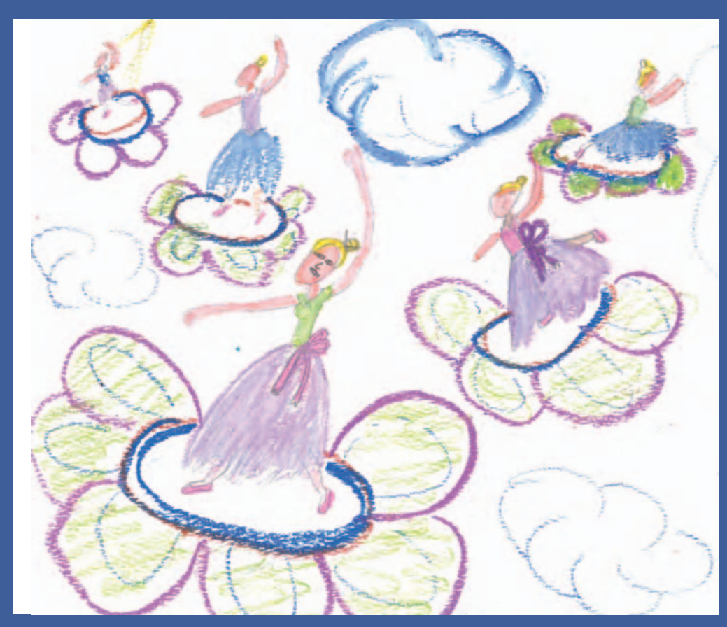
The Flowering Fairies, Sydney

"The Nutcracker Suite made me think of flowers in the sky"