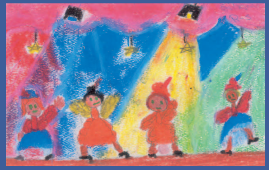
The Can Can Girls, Dysean Broome.

I turned the music on and chose four students to come up to the front of the class and strike a pose. Students studied the frozen poses of their classmates through their viewfinders and sketched what they saw on 9 x 12" (23 x 30.5 cm) newsprint. I rotated students to allow everyone to participate in posing.