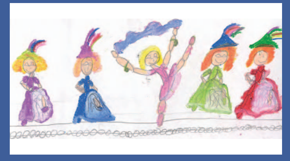
The Sparks, Jessica Eady.

Referring to their many practice drawings, students began to create a composition of dancers on 8 x 18" (20 x 46 cm) strips of white drawing paper. Music played in the background. Students felt the music and interpreted their favorite dancing poses, complete with costume and setting. Students used oil pastels to color their drawings. They blended their colors, moving to the beat of the music.