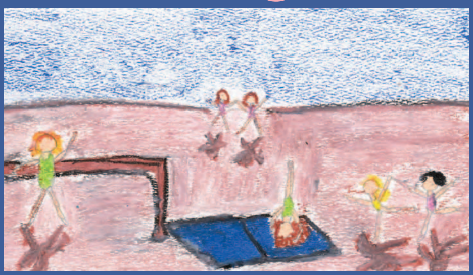
The Gymnastics Girls, Summer Bias

viewfinder, movement, focal point, perspective, gesture, figure drawing