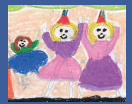
The Gesture Girls, Emily Eastlock.

"The dancing for the Can Can Girls was more exciting, and that is what I wanted to capture in my drawing."