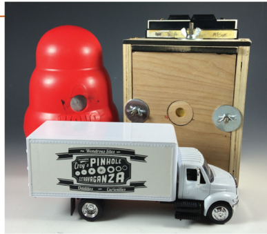
Fig. 1-46. Pinhole camera variety.